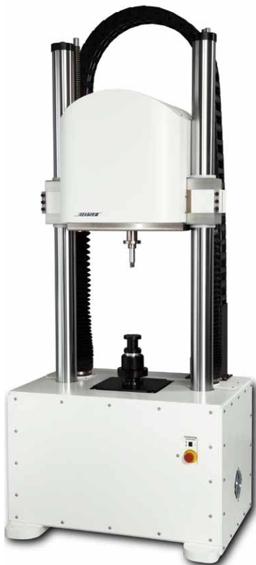
ElectroForce 3510 Test Instrument