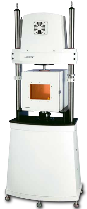
Floor-standing Axial/Torsion 3330 Instrument with Hot/Cold Chamber