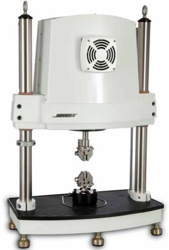
Table-top 3330 Test Instrument

The ElectroForce 3330 table-top configuration is a clean stand-alone package.