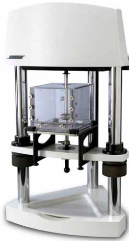
3200 Test Instrument with Saline Bath