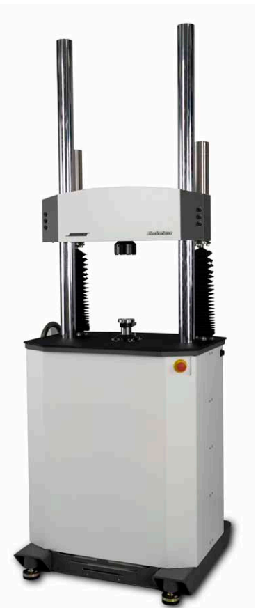
ElectroForce 3550 Test Instrument