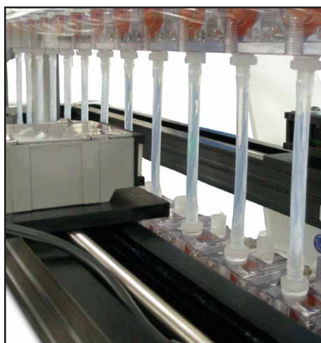
Laser micrometer for measurement and control of pulsatile distension