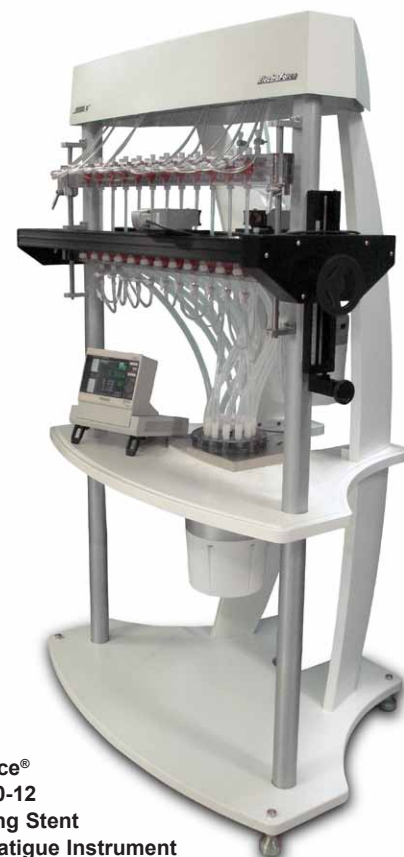
ElectroForce® Model 9210-12 Drug-Eluting Stent Pulsatile Fatigue Instrument